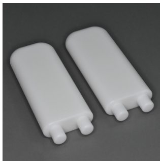
9" FIXED PEGS #HP9020