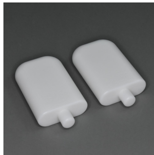
6" PIVOT PEGS #P6030