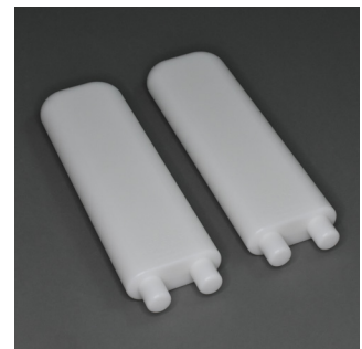
12" FIXED PEGS #HP1220