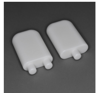
6" PIVOT/FIXED COMBO #HP6021