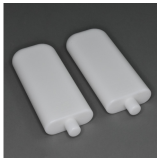
9" PIVOT PEGS #HP9030