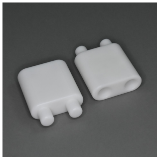
4" PEG EXTENSIONS #HP4020