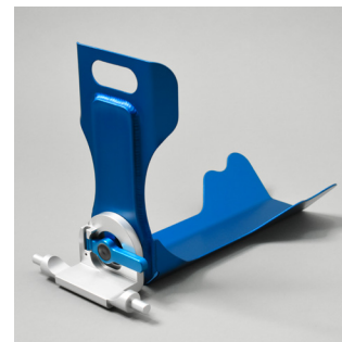
PIVOT FOOT HOLDER #LL920