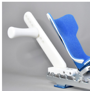
TRACTION TOWER SET #LL2100