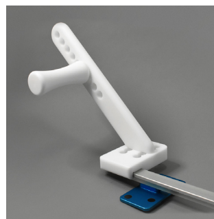
THIGH BOLSTER SET #SR2100