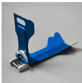
PIVOT FOOT HOLDER #SR920