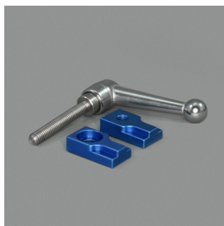
ADJUSTMENT LOCK KIT #SR286