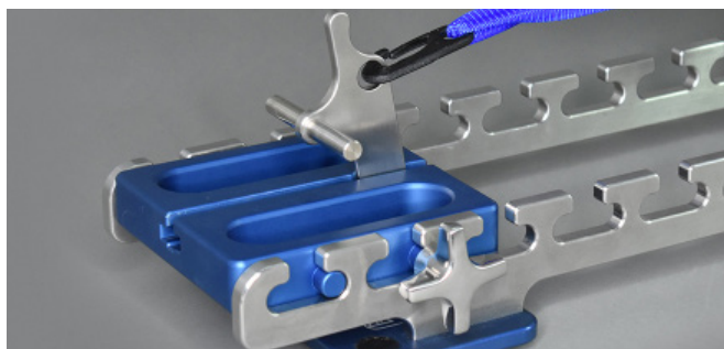
LADDERLOC SPEEDLOC TRACTION SYSTEM #ST1000