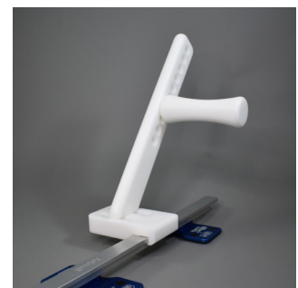
TRACTION TOWER SET #SR2100