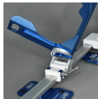
PIVOT FOOT HOLDER #SR910