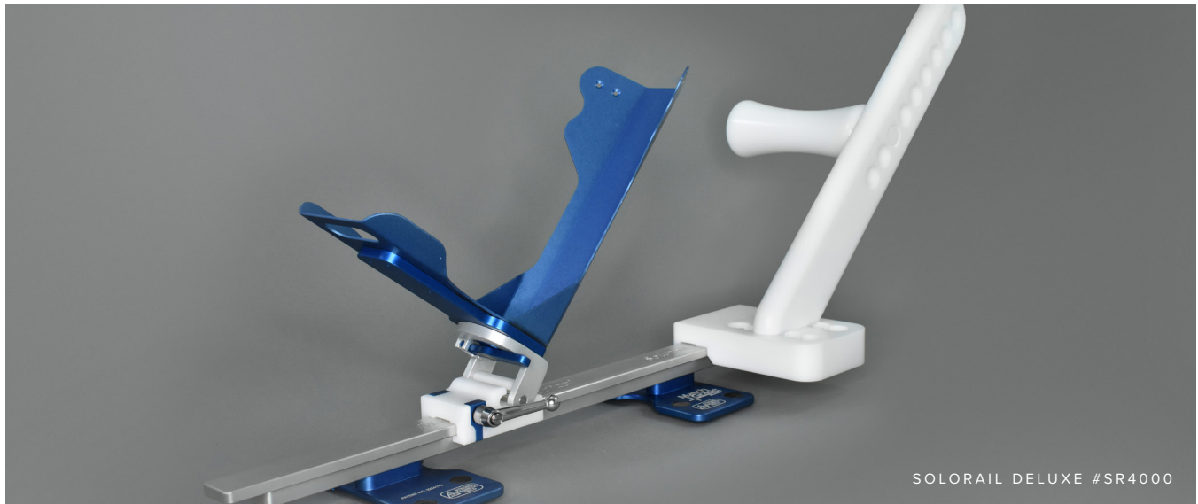
SOLORAIL DELUXE #SR4000

The complete solution to total knee arthroplasty