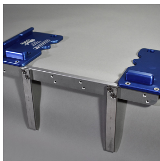
UNIVERSAL MOUNTING PLATFORM #FL500