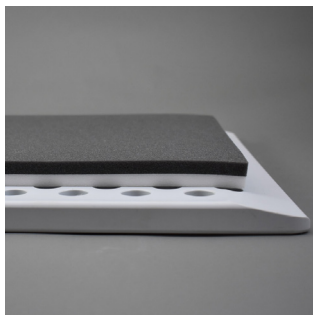
STANDARD BODY PAD (47" X 15" X 1")