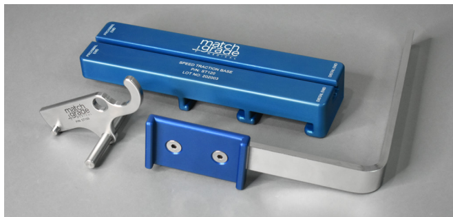
SPEEDLOC ANKLE DISTRACTION KIT #ST1200