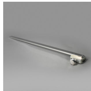
RAIL EXTENSION #EXT1000