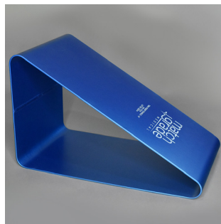
TIBIA/FEMUR TRIANGLE #TF016, #TF014, #TF011