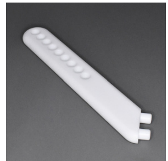
ANGLED TOWER #T3100