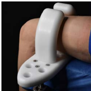
8" BARIATRIC PEGS #LP8000