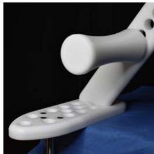
THIGH SUPPORT POST #T3300