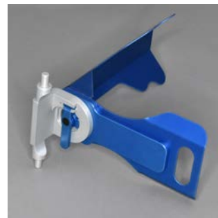
LADDERLOC PIVOT FOOT HOLDER #LL920