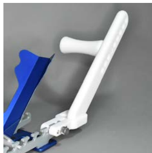
THIGH BOLSTER TOWER #LL2100