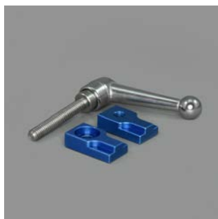
ADJUSTMENT LOCK KIT #SR281