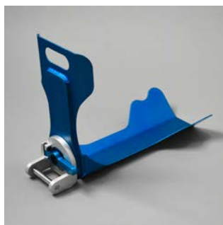
PIVOT FOOT HOLDER #SR920