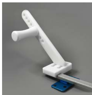
THIGH BOLSTER SET #SR2100