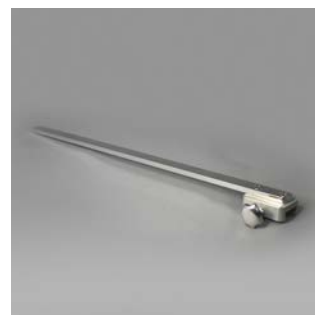
RAIL EXTENSION #EXT1000, #EXT1002