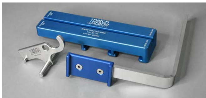
SPEEDLOC ANKLE DISTRACTION KIT #ST1200