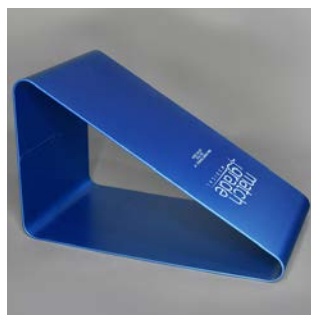
TIBIA/FEMUR TRIANGLE #TF016, #TF014, #TF011