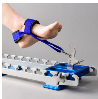
LADDERLOC ANKLE DISTRACTION SYSTEM #ST1000