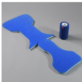
STERILE FOOT HOLDER PADS #FP2500